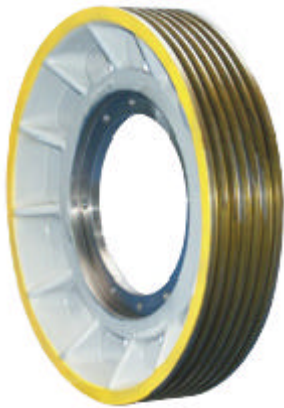
Main (Traction) Sheave