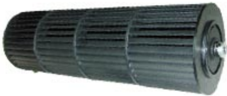
WHEEL & BUSHING